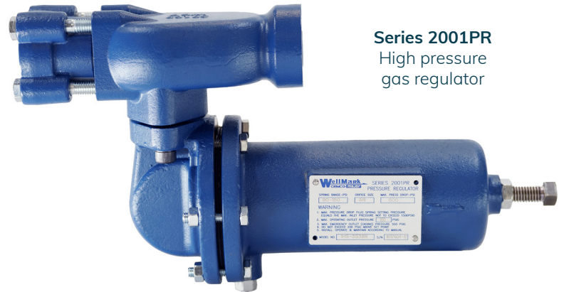
Series 2001PR High pressure gas regulator

1. The sum of the outlet pressure setting and the maximum allowable pressure drop determines the maximum allowable inlet pressure for a given installation. For example, with a 3/8” seat ring orifice (maximum pressure drop of 500 psi) and a 275 psig outlet pressure setting, the maximum inlet pressure is 775 psig (500 psi + 275 psig).